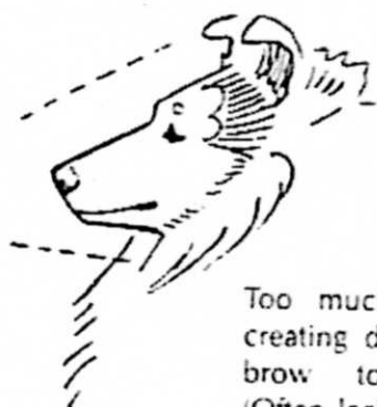
Too much wedge, creating depth from brow to throat. (Often lacking finish to underjaw).