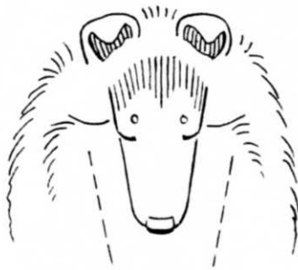
Correct wedge from above.