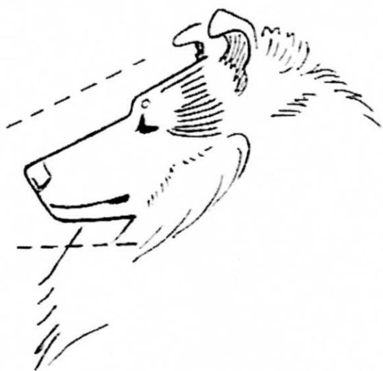
Correct wedge in profile.