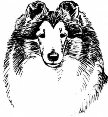
Correct Head: Front View